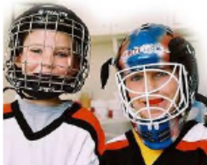
If your children play sports, be sure to get proper mouth protection for them. Mouthguards can help prevent painful—and costly—mouth injuries.

Sporting Goods stores sell pre-formed mouthguards for you to fit at home.