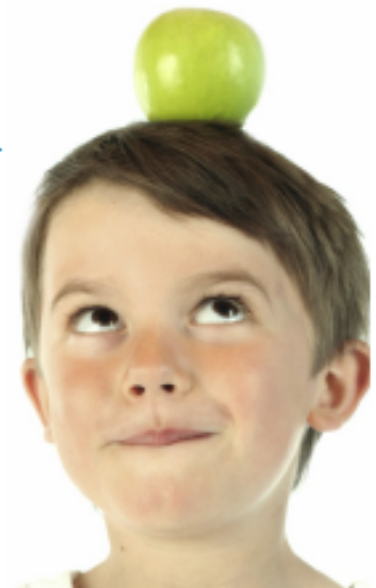
Consult Canada's Food Guide for ideas on snacks for your kids. But you can never go wrong with an apple...

Directions: Mix together or layer in a cup