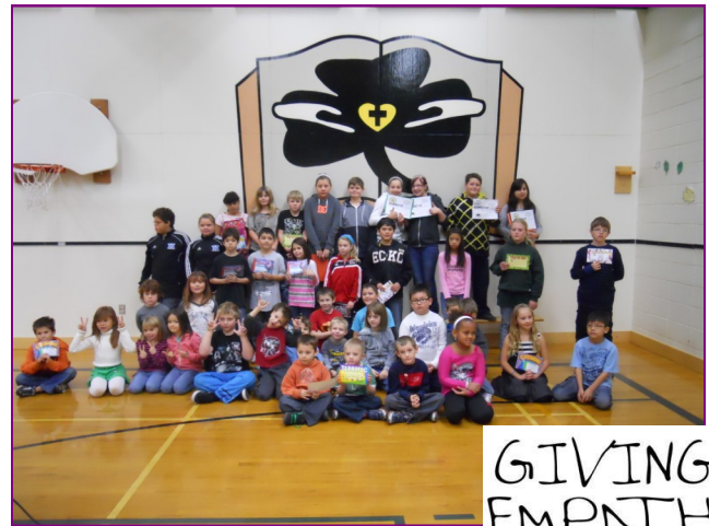
Our Award Winners!