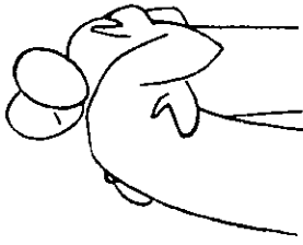
Greet one another with the kiss of peace. (16:16)

“Forgiveness is not an emotion, it’s a decision.”